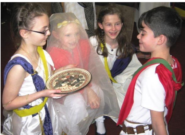
Making offerings to the temple oracle.

On 1 st February, our Year 5 children took part in an Ancient Greece Day as part of their History curriculum looking at the achievements, legacy and influences of Ancient Greece. Year 5 learnt a great deal, had a huge amount of fun and were perfect in character role dressed in costumes. The children experienced a variety of crafts and skills including; carving letters in wax, producing apothecary remedies for ailments, making mosaic tiles, designing charm bracelets and making clay bowls. A fascinating day for everyone and many thanks to our fabulous parent helpers and wonderful cake makers!