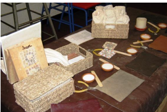
Preparing to make mosaic tiles.