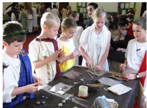
Making charm bracelets.