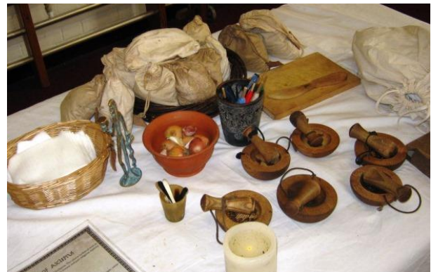
Apothecary materials for herbal remedies.